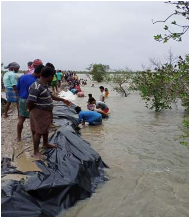
Villagers trying hard to fix the river embankments in G-plot