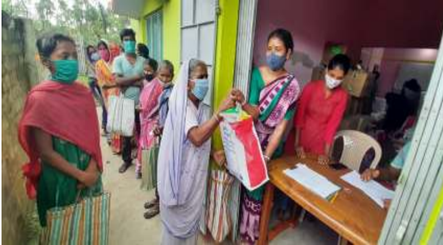
Relief distribution at Gopalnagar, Patharpratima block