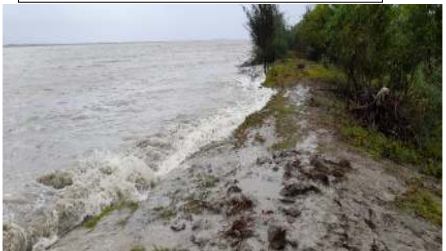
Breaches of river embankment and overflows of river water over the bunds in Krishnadaspur in G-Plot GP