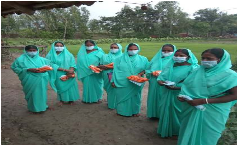
Hygiene kit distribution at Ramganga Gp of Patharpratima block