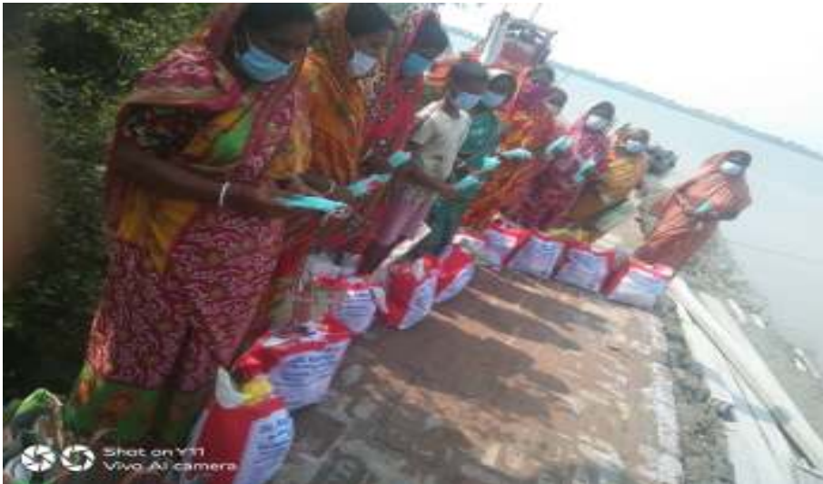
Relief distribution at Brajballav pur of Patharpratima block