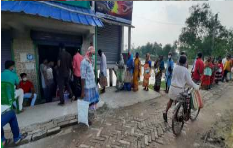
Relief distribution at Durbachati of Patharpratima block