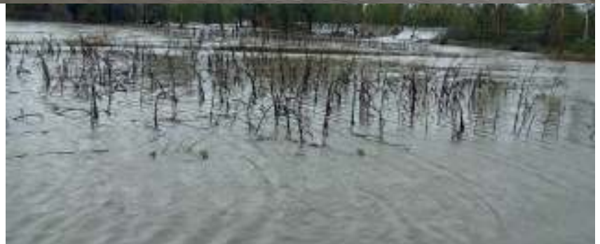
River water inundated paddy fields, ponds in the Uttar Gopalnagar village of Gopalnagar GP in Sunderbans