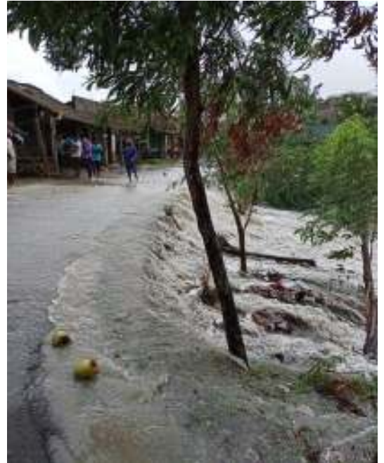
River water overflows roads and enters into cropping fields in G-plot,