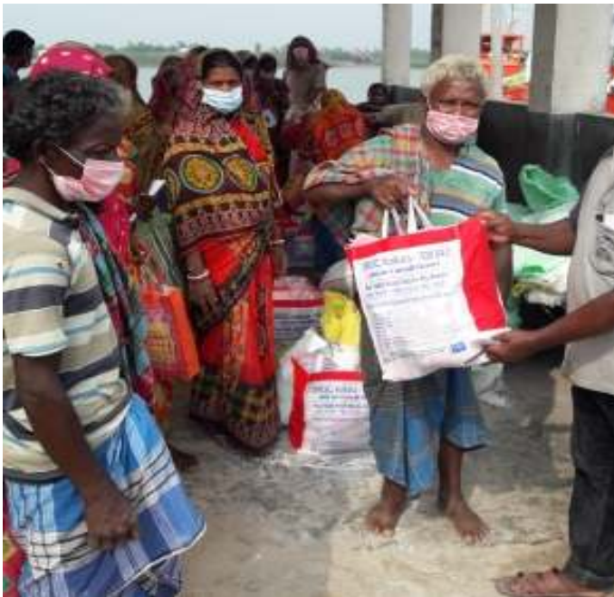
Relief distribution at Gplot of Patharpratima block