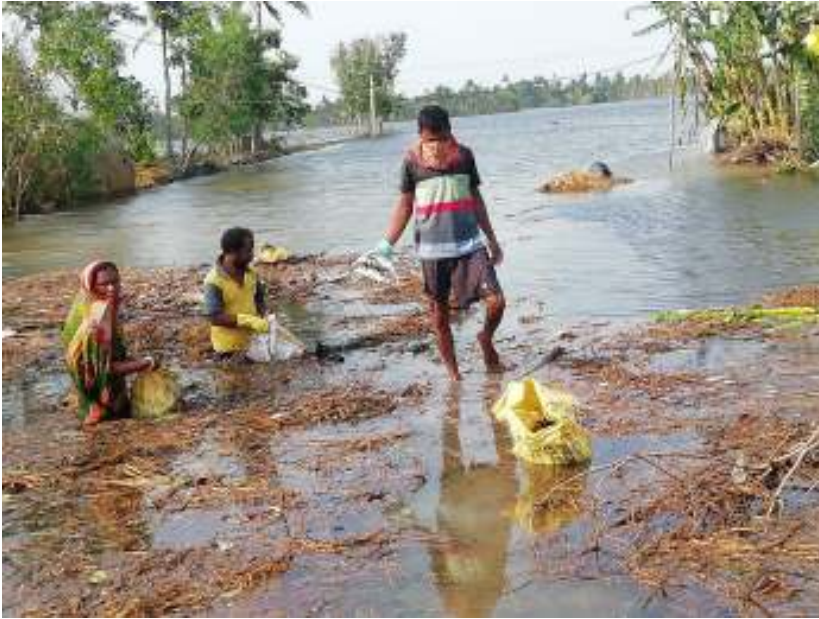
Massive destruction in agricultural land in Gobindapur Abad village in Brajballavpur GP